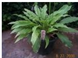
H. 'Roller Coaster Ride'