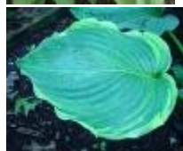
From Hosta Library H. Roller Coaster

Names of Hostas that are also Rides at Cedar Point.