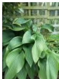
H. 'Gate Keeper' From Hosta Library