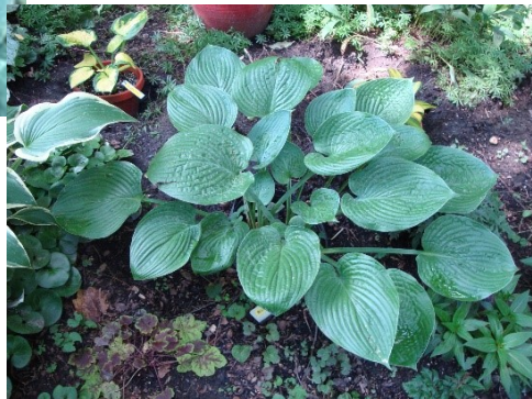
H. 'Blue Hawaii'