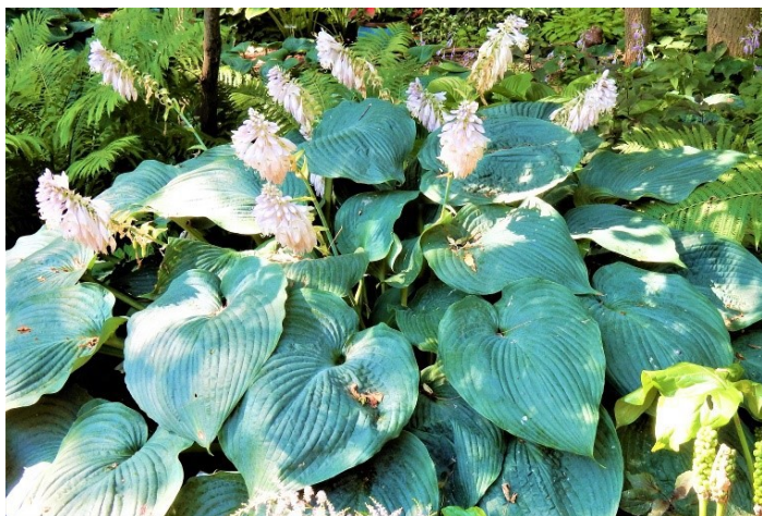
Hosta 'Blue Angel'

Leaves of blue hostas are basically dark green. The blue color is visible due to a layer of wax on the leaves' surface. This phenomenon is unique in the plant world since hostas are shade tolerant, and most plants with a blue surface coating, as seen in many cacti, yuccas, agaves, etc., have it as protection against the sun. Most blue hostas are resistant to slugs and snails, because the wax is bitter and they do not like it. Some hosta cultivars have a thick wax layer; on other cultivars it is thinner. The thicker the wax layer, the more intense the blue color that the hosta develops. Also, the color is longer lasting. In direct sun-under the influence of heat, the wax layer degrades and gradually disappears. That is why most blue hostas are green-blue or just dark green from mid-summer until autumn. Try it yourself: Slightly wipe the wax layer from the leaf with your finger and the leaf will become green. It is that easy to remove.