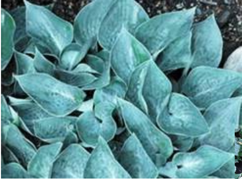
H. 'Blue Lollipop'