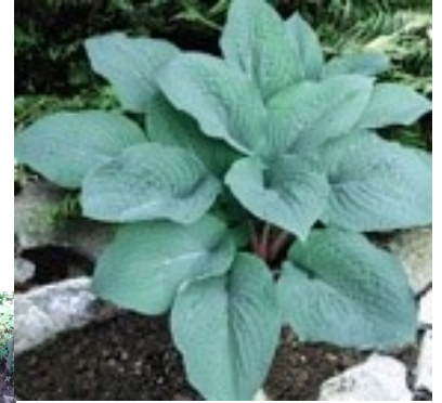
H. 'Blueberry Muffin'