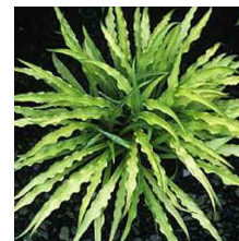
2016 HOSTA of the Year Curley Fries