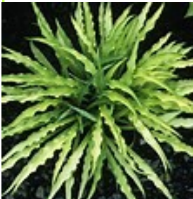
H. 'Curly Fries'