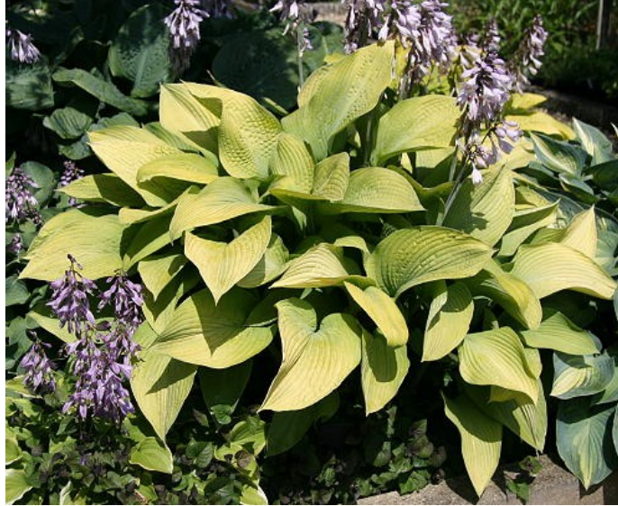
H. 'Gold Regal'